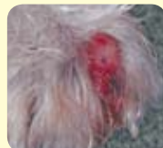
Paw of a dog with an interdigital cyst caused by a grass seed