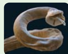
Adult A. vasorum lungworm

Angiostrongylus vasorum can cause a wide range of symptoms – some severe, including coughing, lethargy, fits and blood clotting problems. However other pets may show no obvious signs of problems.