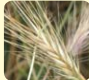
Grass awns of the summer grasses