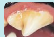
Unhealthy mouth with gingivitis and calculus