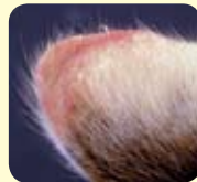
Ear tip of a cat showing cancerous changes