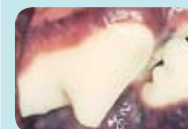
Healthy mouth with white teeth and healthy pink gums